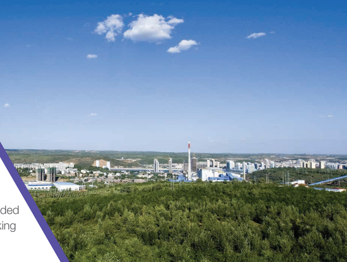
Overview of the Shendong coal mine area