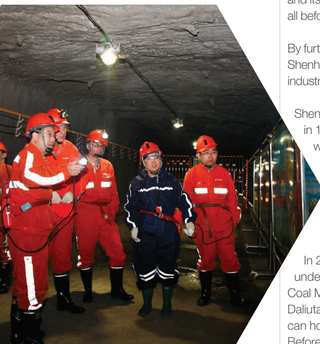
Introducing the coal mine underground reservoir technology to visitors

The company is now applying its underground reservoir technology in other mining areas, including Baotou and Xinjie – and considers it well worth commercialising to help coal miners in other arid areas of the world.